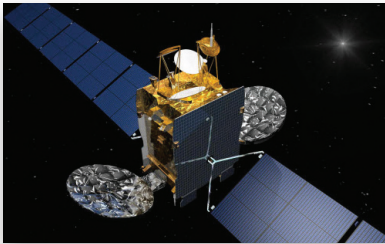
Hot Bird 7.

My company, Astrium Ltd., is Europe's leader in space transportation, satellite systems, and related services. Our company motto says it best: "Astrum – All the space you need."