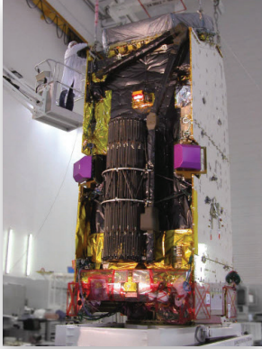
Inmarsat 4

identifying common elements across multiple projects, we were able to establish clear ownership and traceability in our code, rather than relying on people working on Project A or Project B in isolation.